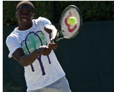
Frances Tiafoe, Age: 18, ATP Rank: 176

Capitalize on this opportunity to gain a competitive advantage through specialized training from America's top coaches and rising stars.