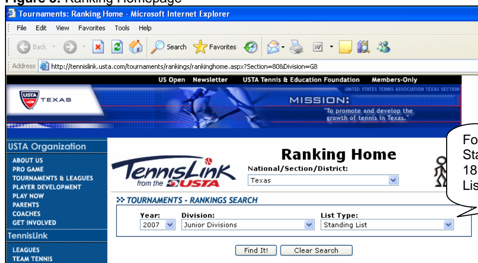
Figure 3: Ranking Homepage