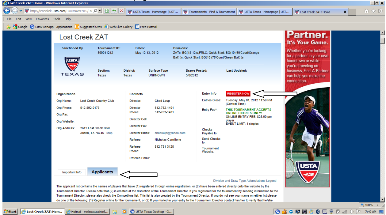
Figure 1: Online Tournament Homepage

Once at the tournament homepage (see Figure 1) click on “Click Here to Register Online” (see arrow).