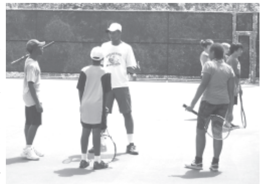
2011 NJTL Kids Day - Players receive instructions

Email or call: Bertsy@tx.rt.com or 817-247-9977.