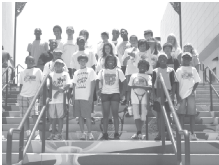
Slam Jammers at the Davis Cup in Austin (USA vs Spain)