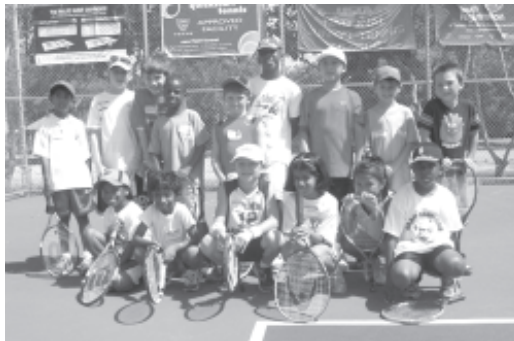
DTA QuickStart Tournament participants

The DTA held its second summer QuickStart Series tournament on July 30th at the QuickStart Courts in Kiest Park. The 16 participants played a team format tournament and received prizes and snacks. This tournament series was designed to introduce 10 & under tennis players to competitive tournaments and team play.