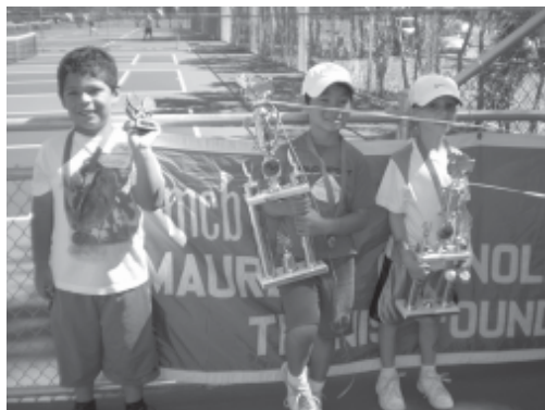
Mini Mo 5 & 6 Year Old Division Champions

Enter online at tennislink.usta.com/tournaments , and use tournament id #800019810.