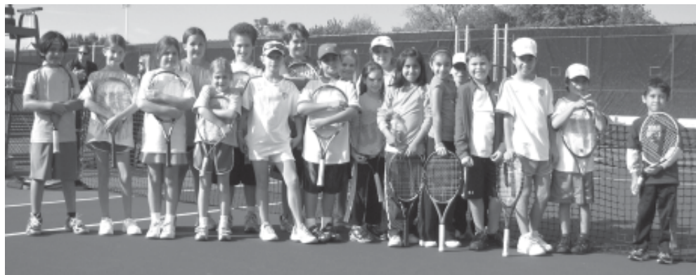
Dallas Junior Team Tennis 10 & under QuickStart November Playday Participants

The 2011 spring season of NJTL Slam Jammers begins March 5th. Applications will be available in January.