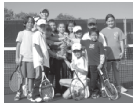
T Bar M's 10 & under QuickStart Team

18 & under Advanced 1st - ROCC UR World (Royal Oaks)