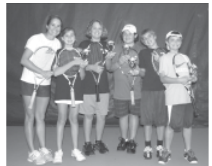
Seay's 12 & under Intermediate Team