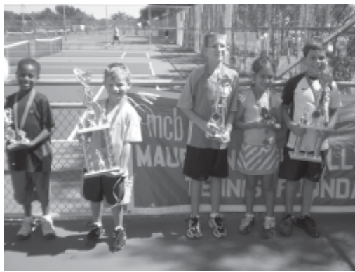
Mini Mo 7 & 8 Year Old Division Champions