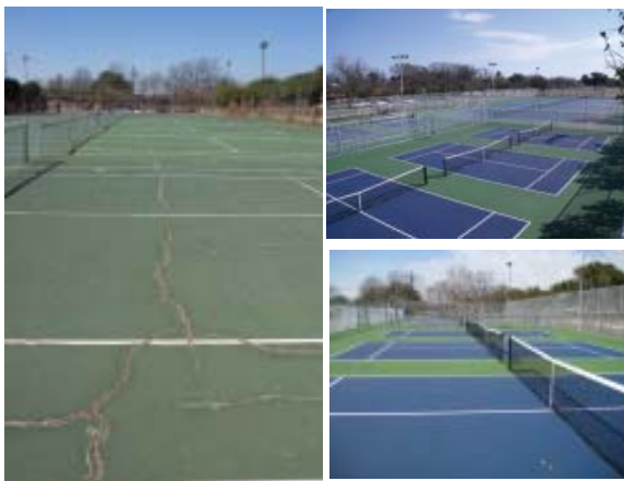
Kiest Park Tennis Courts - Before & After the Renovation

The DTA is excited about the growth potential at Kiest Park. The organization is using the new facility for its National Junior Tennis and Learning (NJTL) and Slam Jammers programs. The Saturday Slam Jammers group has more than tripled its participation since the new courts opened. This summer a program for senior citizens will be offered as well as a QuickStart tournament and Junior Team Tennis.