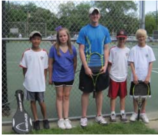
Champions 12 & Under Beginners - Las Colinas CC

18U Open – Royal Oaks CC. “ROCC UR World”