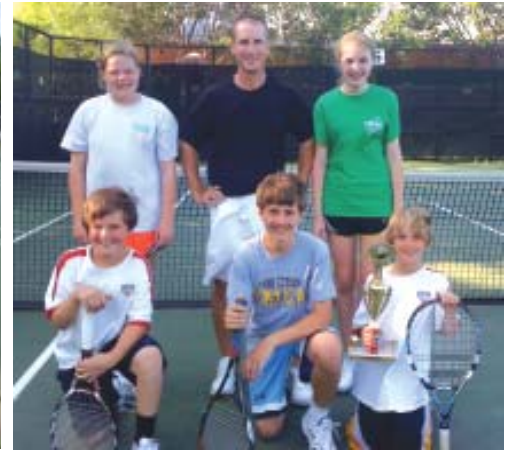
Champions 14 & Under Beginners - Dallas CC