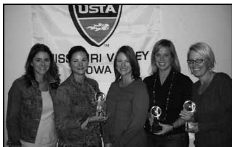
2.5 Adult League National Champions (team is from Des Moines, IA)