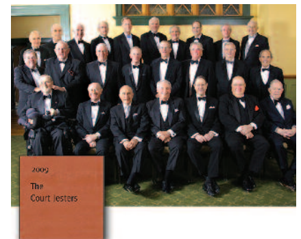
2009 THE COURT JESTERS

The Lancaster Country Club Court Jesters who have been playing together for more than 40 years, are among the latest additions to the USTA Serves Avenue of Aces. Each of the 25 members contributed toward the $1,000 brick paver at the USTA Billie Jean King National Tennis Center, just another example of their outstanding philanthropy, which has enabled more than 200 inner-city Lancaster, Pennsylvania, children to participate in tennis programs. Sincere thanks to the Court Jesters for their ongoing support of kids, tennis and education.