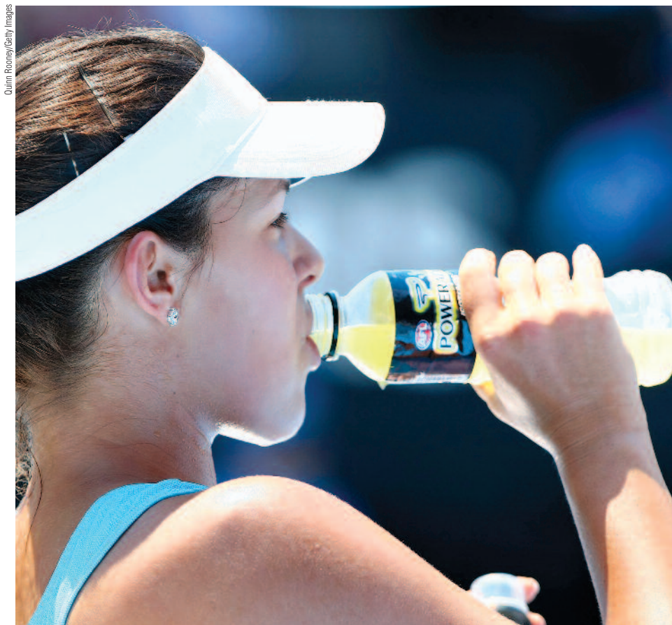
Quinn Rooney/Getty Images