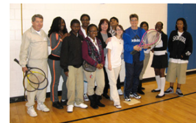
High school racket giveaway

SATA has participated in several meetings with local politicians, school district personnel, the USTA and other community partners. A strategy to grow this important programming to the children of Savannah has been set in motion.