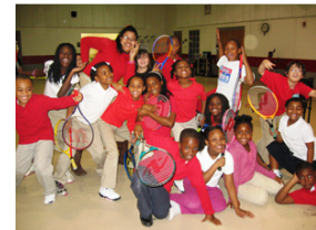
Barlow Elementary School